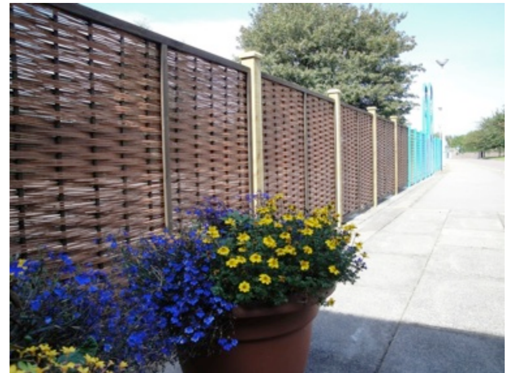
Brocks Hill Primary School Client : Leicestershire County Council Completed : 2009 Budget : £18,000