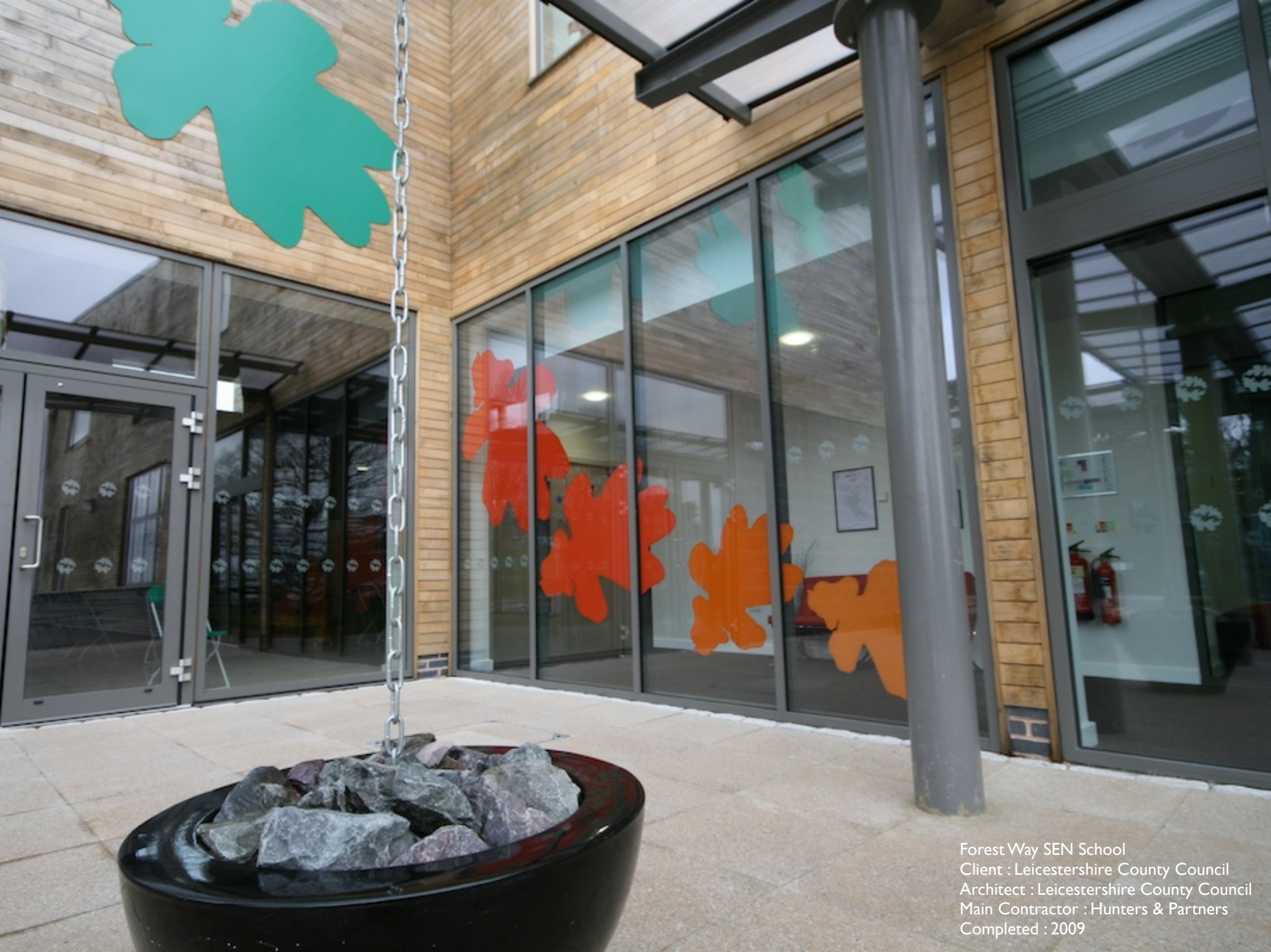
Forest Way SEN School Client : Leicestershire County Council Architect : Leicestershire County Council Main Contractor : Hunters & Partners Completed : 2009