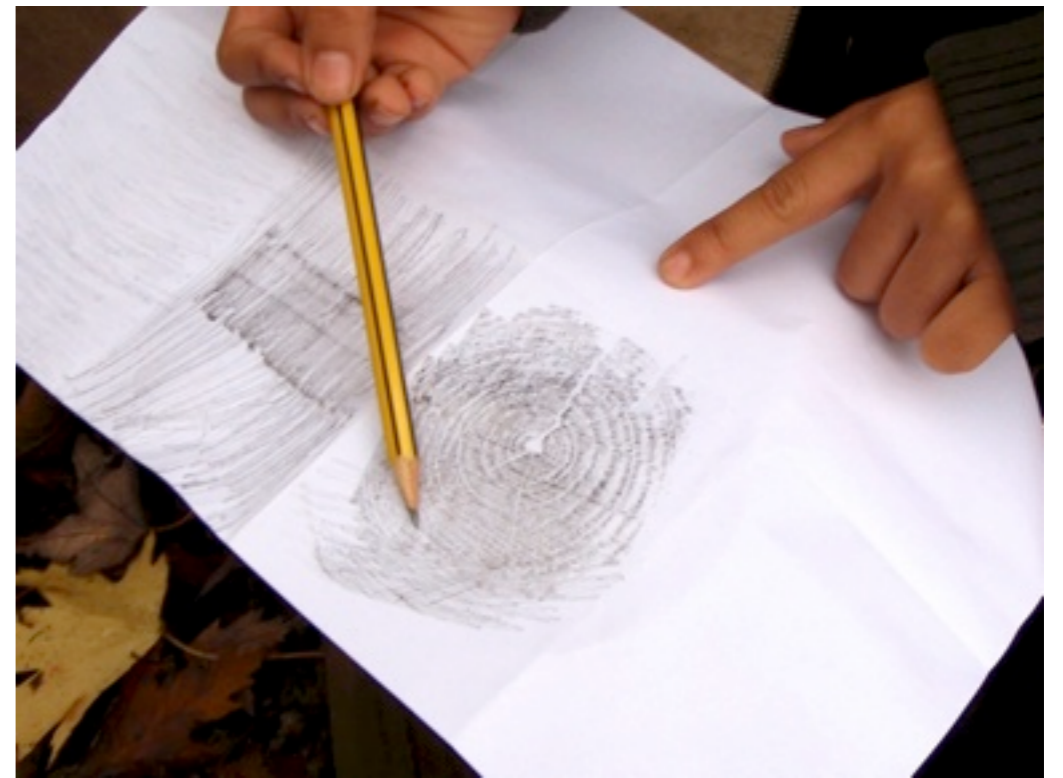
St Georges Primary School Completed : 2009 Budget : £6,000